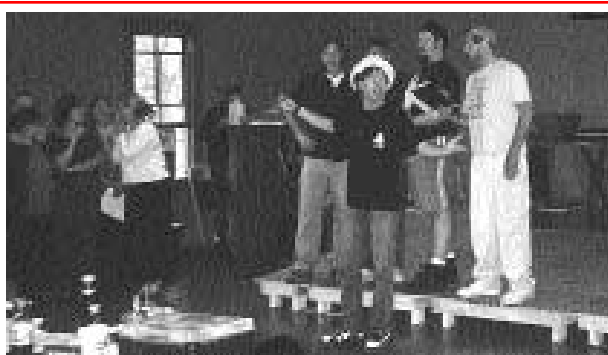
The 2001 Company rehearsal in the newly refurbished Grange Hall rehearsal room #1

It's been a bumpy road. We were forced to replace the roof of the building due to its collapse this past winter, and although money from insurance covered the replacement cost, it did not cover the damage caused by the collapse. All that said, we brought the building up to 'code' so it could be ready for rehearsals this past summer and the Theatre moved their business offices into the first floor office space.